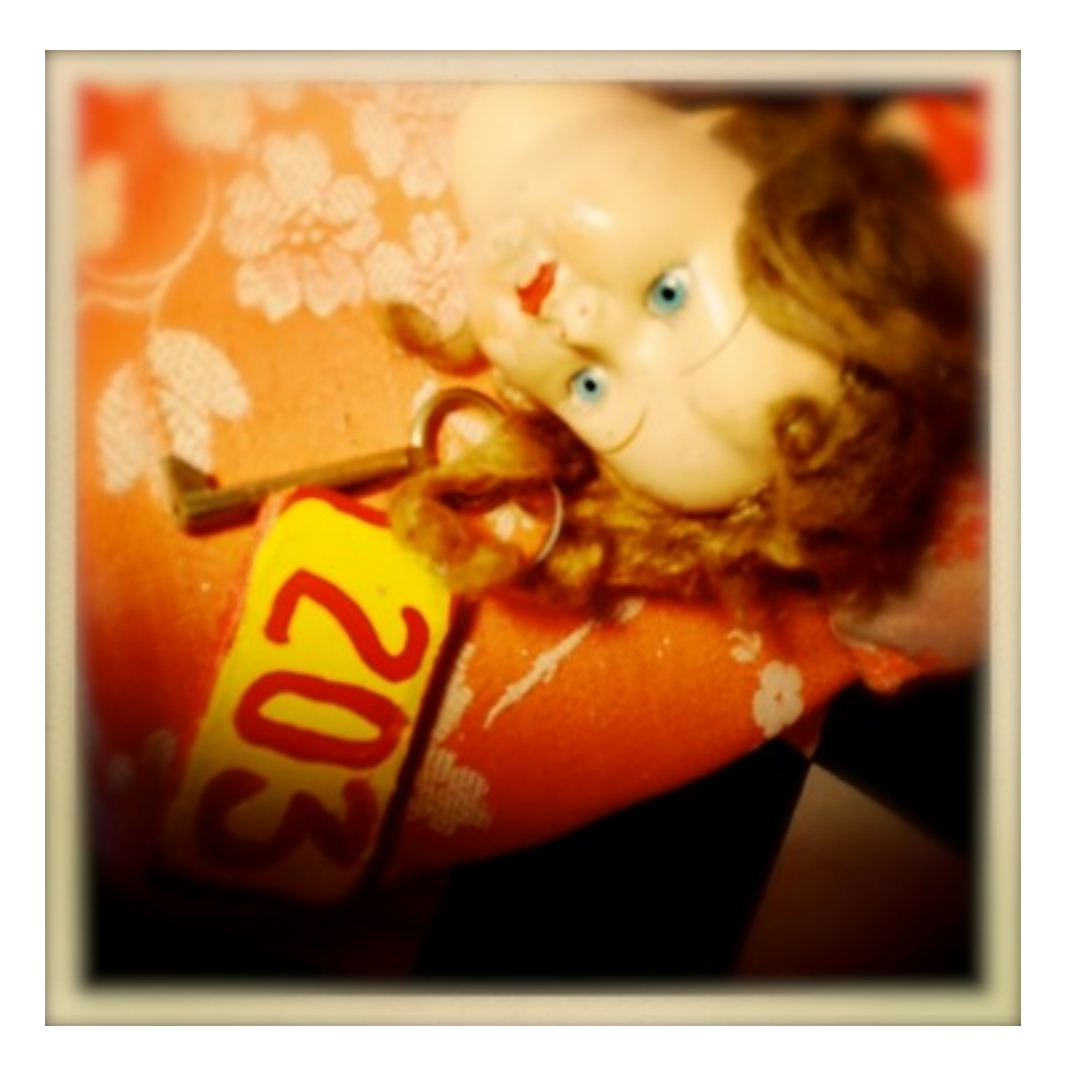
A performance about the highs and lows of Hollywood love